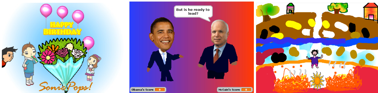
Figure 4: Screen shots from sample Scratch projects

We continue to be amazed by the diversity of projects that appear on the Scratch website. As expected, there are lots of games on the site, ranging from painstakingly recreated versions of favorite video games (such as Donkey Kong) to totally original games. But there are many other genres too. Some Scratch projects document life experiences, such as a family vacation in Florida, while others document imaginary wished-for experiences, such as a trip to meet other Scratchers. Some Scratch projects, such as birthday cards and messages of appreciation, are intended to cultivate relationships. Others are designed to raise awareness on social issues such as global warming or animal abuse. During the 2008 U.S. Presidential election, there was a flurry of projects featuring Barack Obama and John McCain – and then a series of projects by Scratchers self-organizing an election for the not-quite-defined position of “President of Scratch.”