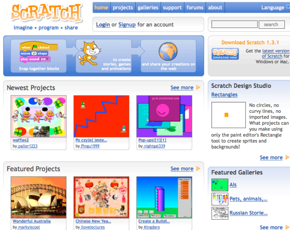
Figure 6: Scratch website

browser (using a Java-based player), comment on the project, vote for the project (by clicking the “Love it?” button), or download the project to view and revise the scripts. (All projects shared on the website are covered by Creative Commons license.)