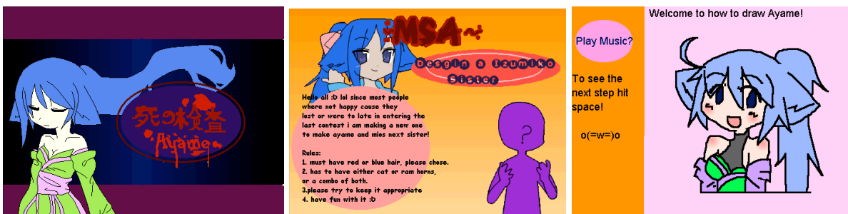
Figure 1: Screen shots from BalaBethany’s anime series, contest, and tutorial

Over the course of a year, BalaBethany programmed and shared more than 200 Scratch projects, covering a wide range of different types of projects (stories, contests, tutorials, and others). Her programming and artistic skills progressed over time, and her projects clearly resonated with the Scratch community, receiving more than 12,000 comments.