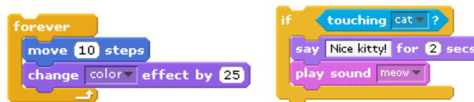
Figure 2: Sample Scratch scripts

We wanted the process of programming in Scratch to have a similar feeling. The Scratch grammar is based on a collection of graphical “programming blocks” that children snap together to create programs. As with LEGO bricks, connectors on the blocks suggest how they should be put together. Children can start by tinkering with the blocks, snapping them together in different sequences and combinations to see what happens. There is none of the obscure syntax or punctuation of traditional programming languages. The floor is low and the experience is playful.